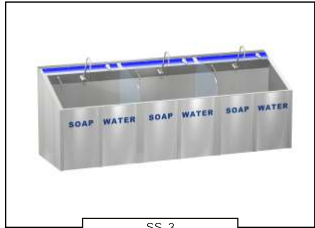
Fixture May Show Some Available Options

Please visit www.whitehallmfg.com for most current specifications.