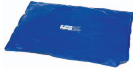
Oversized (13"x 18.5")