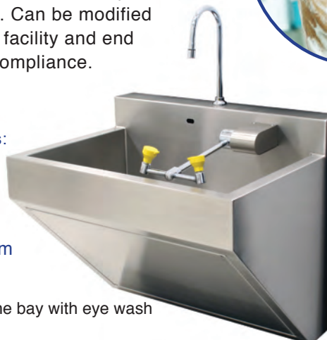
Compact one bay with eye wash