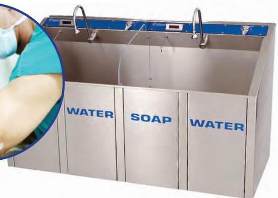
Two bay standard