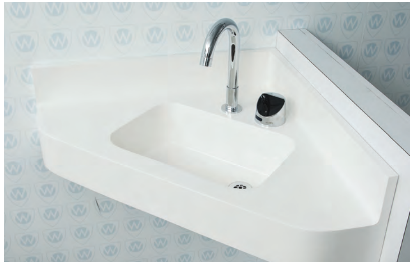
Solid Surface Corner Sink