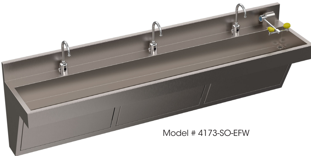
Model # 4173-SO-EFW