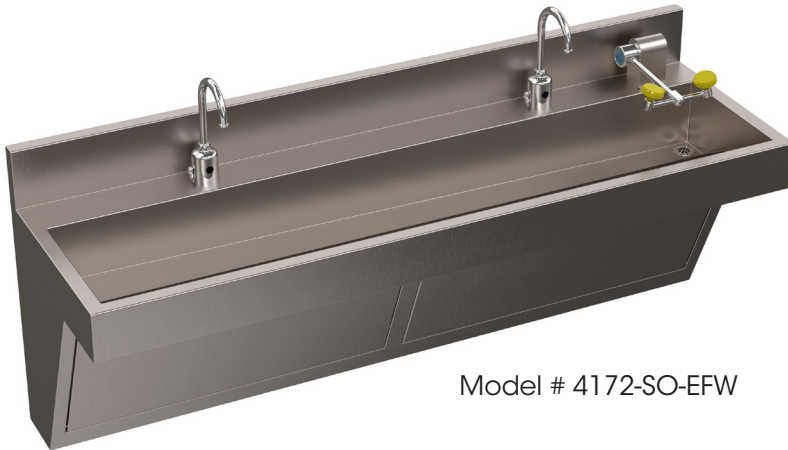
Model # 4172-SO-EFW