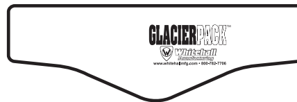
ICV1 - Cervical Size 23" Long (584 mm) Shipping Weight 4 lbs (1.82 kg)